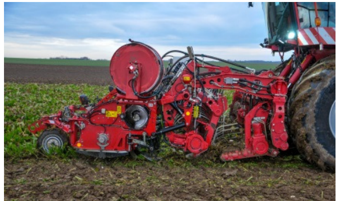
Lifting with Holmer EasyLift.

MG: Well, we just added up the numbers: If a driver runs the lifter an extra 3/8" deeper than necessary the Terra Dos has to cope with 30 tons of additional soil per acre. This increases fuel consumption and the additional soil has to be removed from the beets – and the wear parts are subjected to higher strain. Before, all six shares were attached to one beam and they all had the same working height,