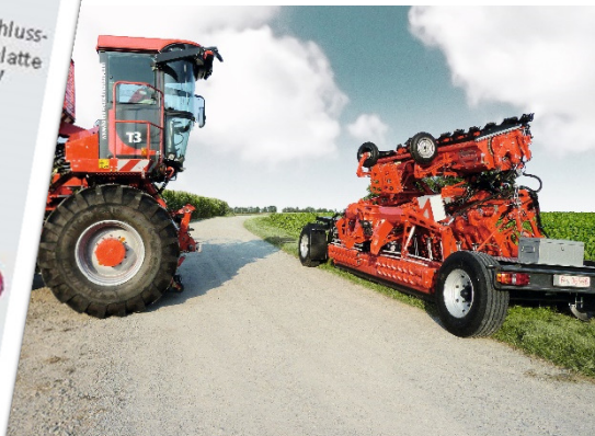
Terra Dos T3 approaching the lifter on the transport wagon.