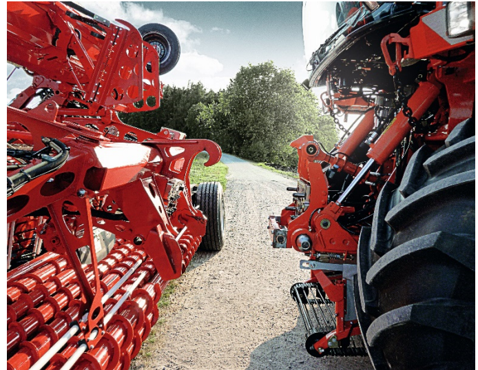
Coupling with HOLMER EasyConnect.

AW: No, all connections are contained in the EasyConnect coupling plate – also the connection of the headlights to the power supply!